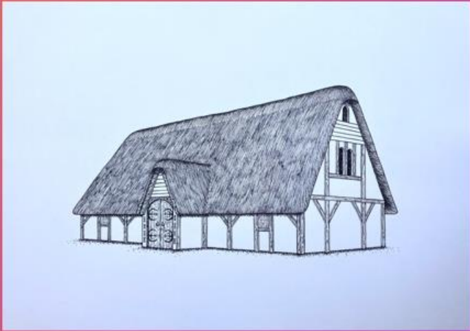
Illustration of the pre-Norman, Anglo-Saxon royal hall within Queen Edith's royal manor in Oakham, based on information found at the royal Saxon manors of Rendlesham and Wychurst.